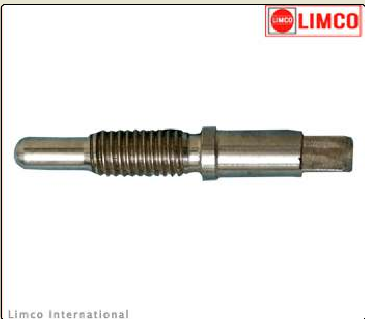
SPP-01 SPINDLE STANDARD FOR OXYGEN