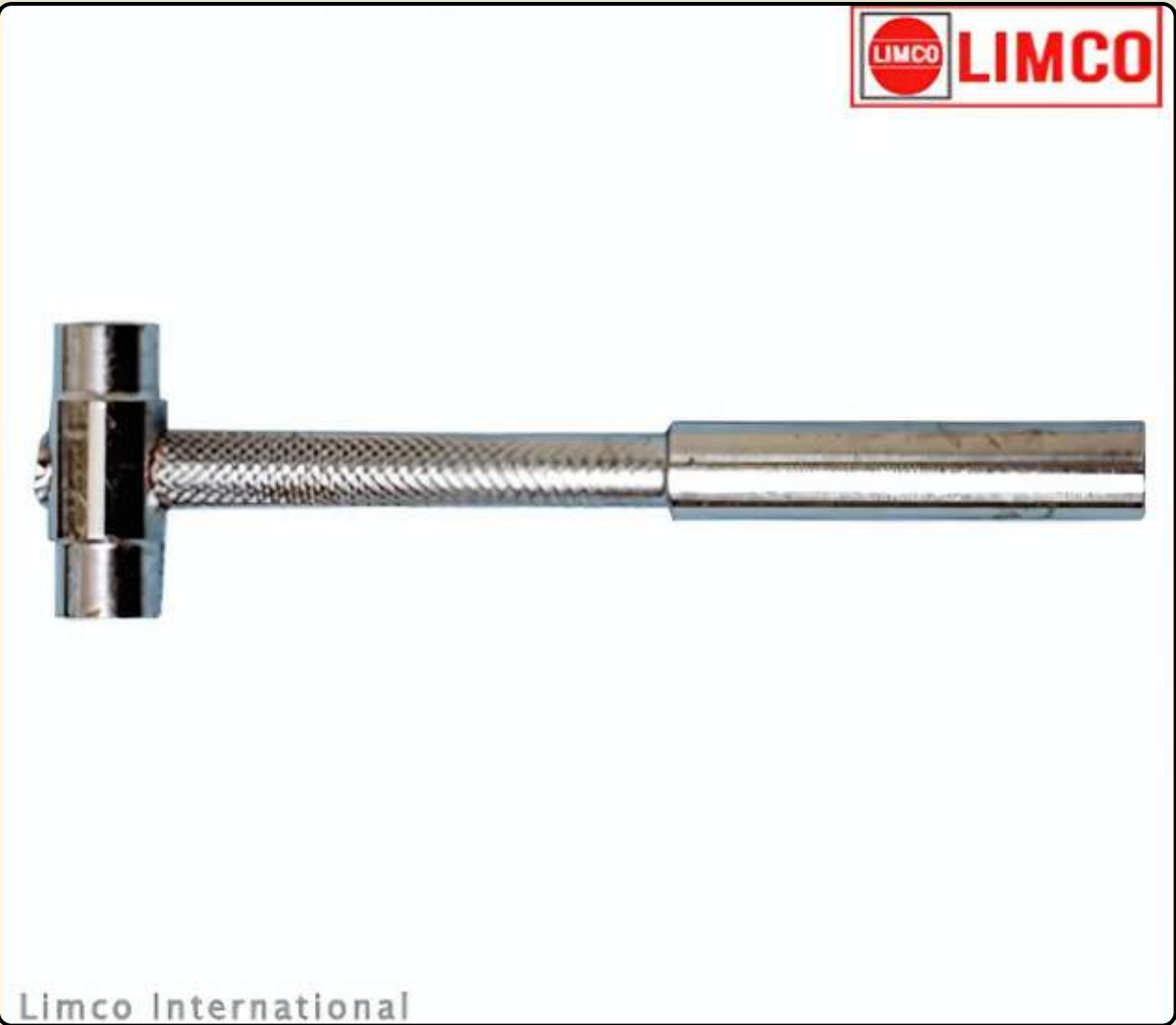
SPK-DX2 SPINDLE KEY CO2 FOR PLANTS HEAVY DUTY (HARDENED & TEMPERED)