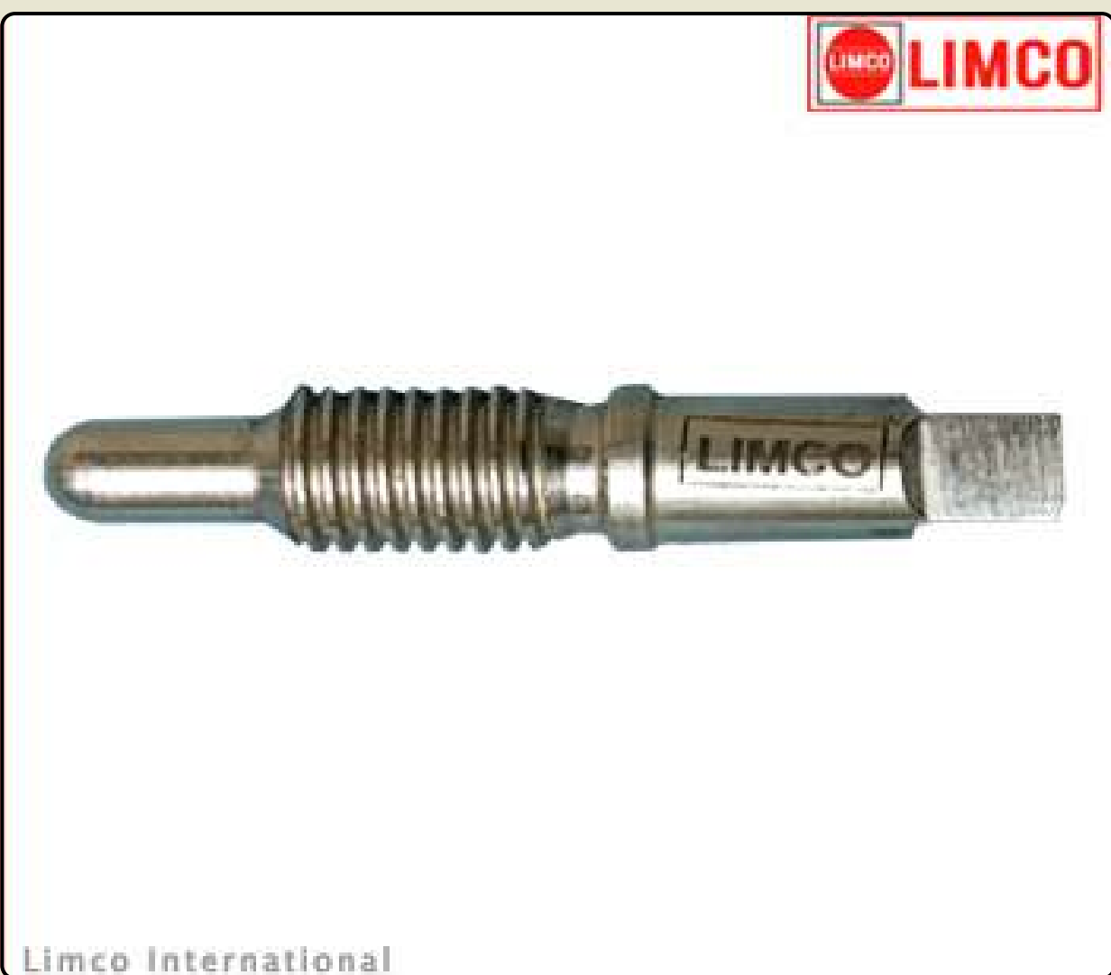
SPP-02 SPINDLE OVERSIZE