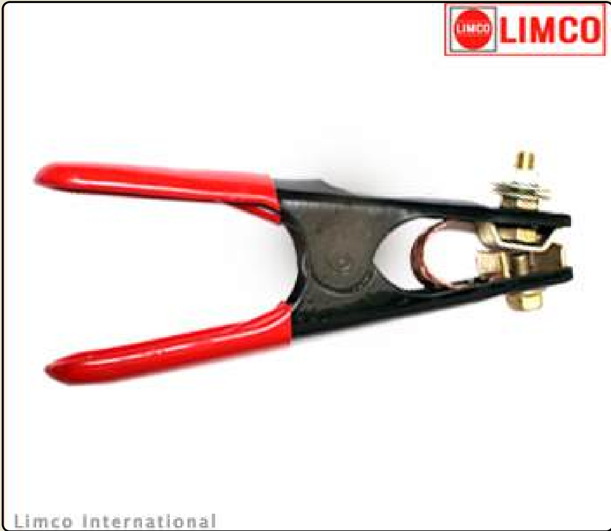
LEC-06 EARTH CLAMP 400 AMP INSULATED