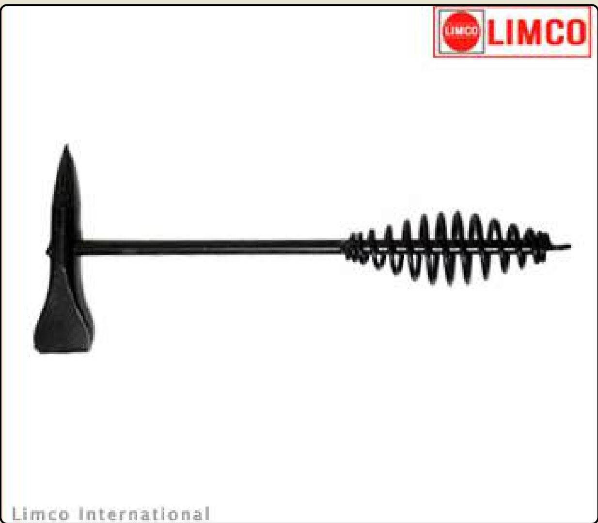
LCH-03 CHIPPING HAMMER HEAVY