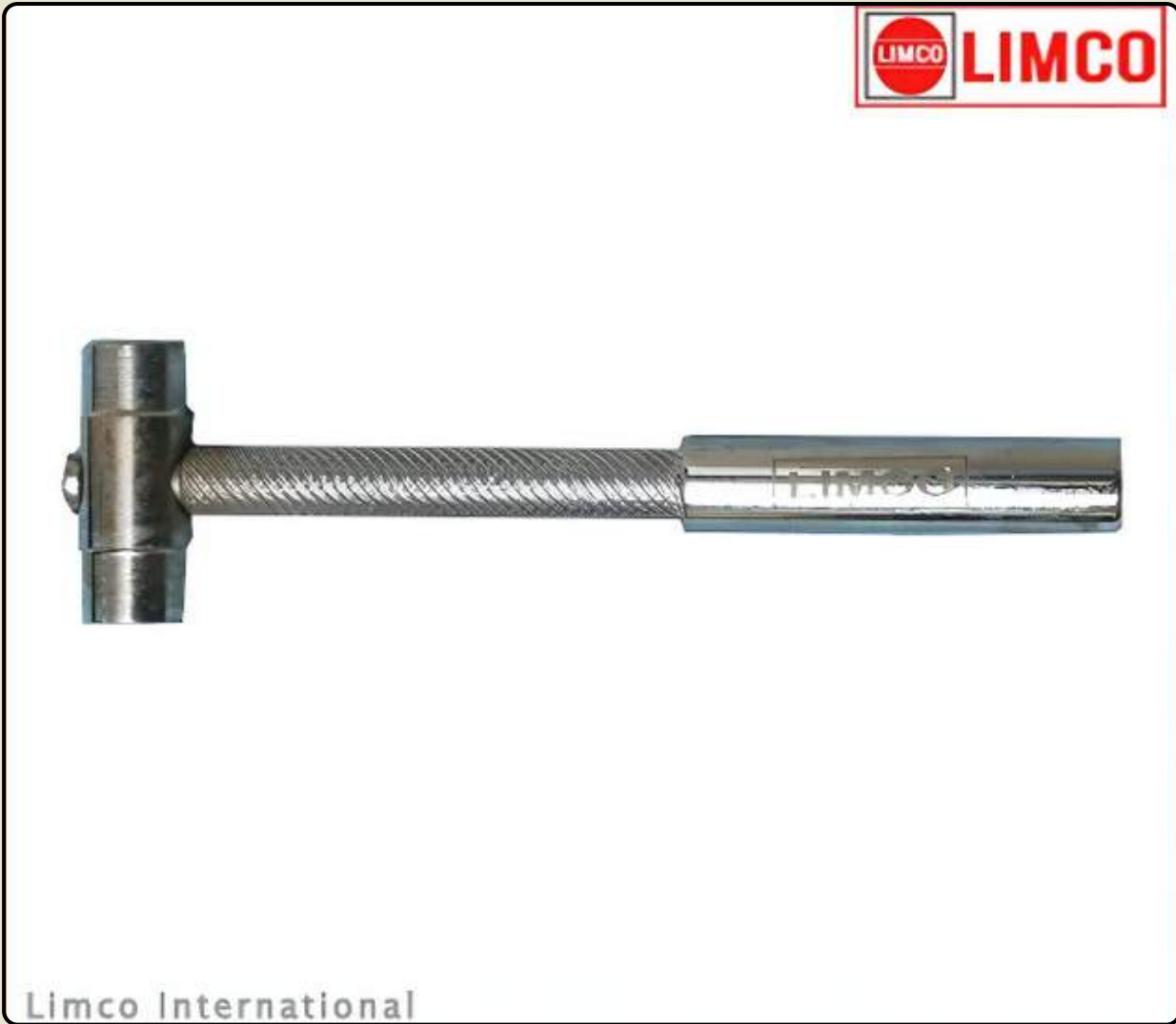
SPK-DX1 SPINDLE KEY O2 FOR PLANTS HEAVY DUTY (HARDENED & TEMPERED)