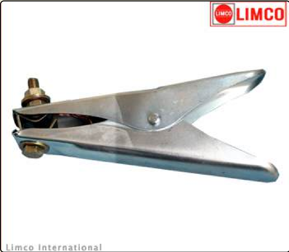
LEC-07 EARTH CLAMP 600 AMP