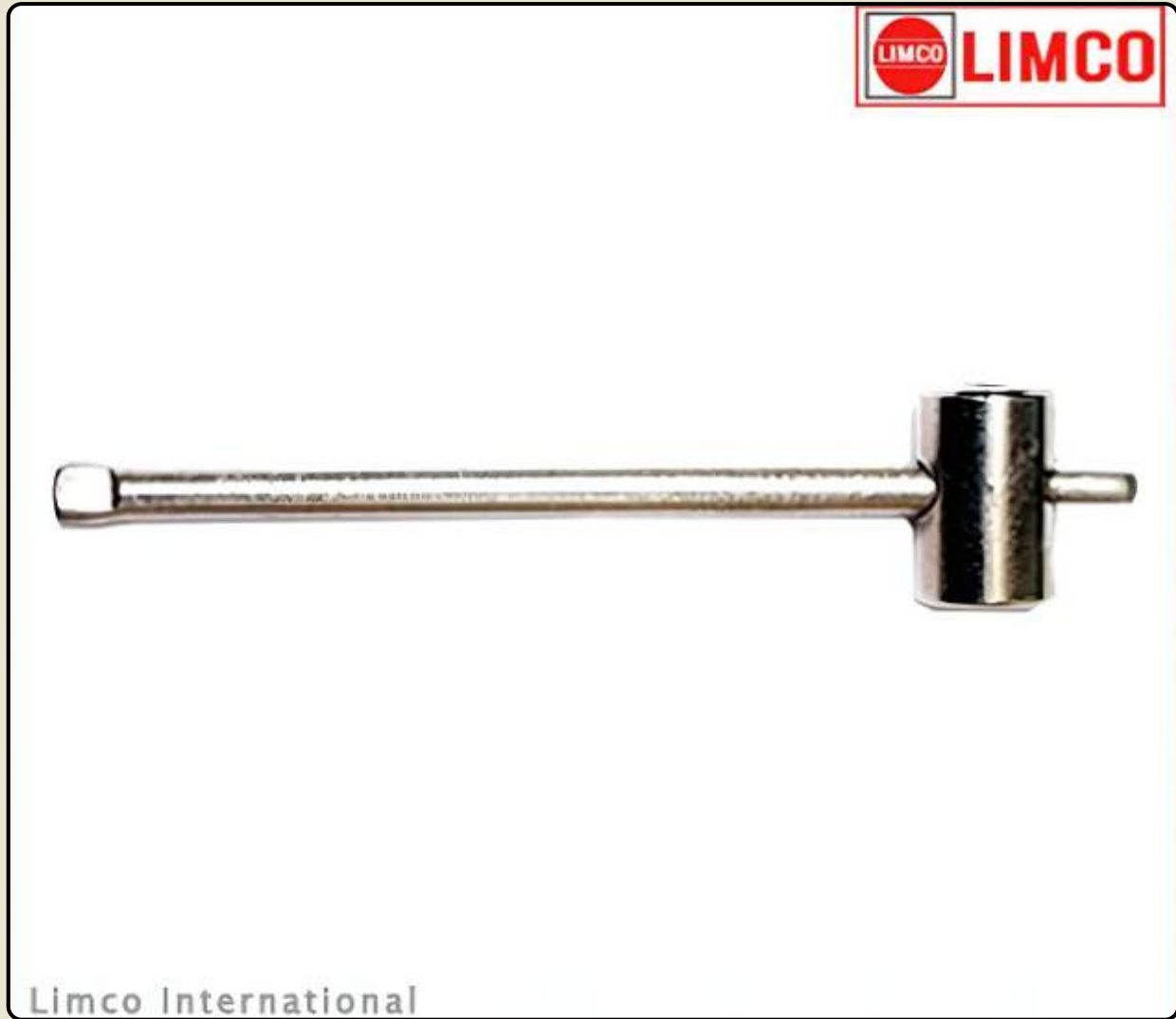
AC SPINDLE KEY