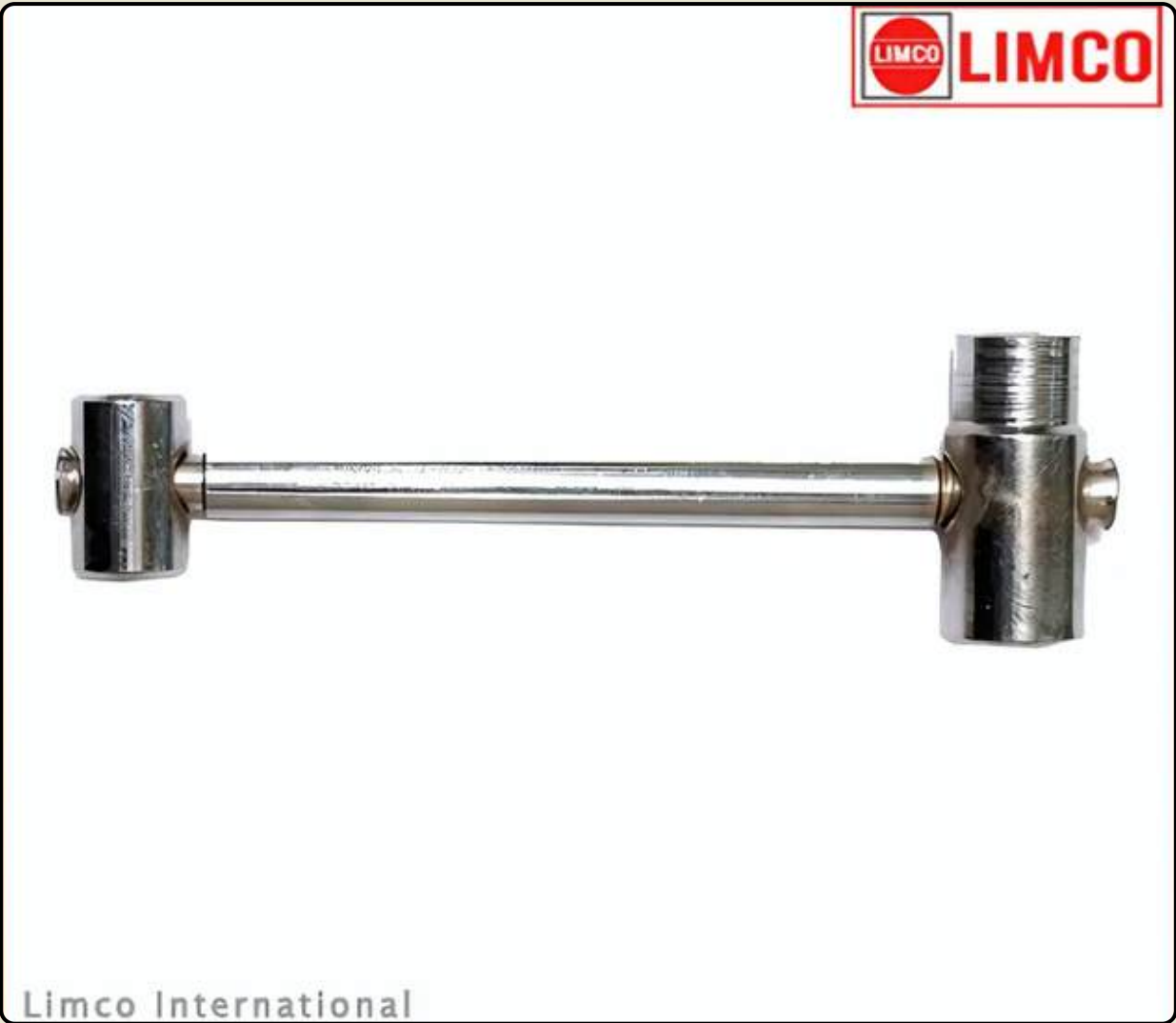
DOUBLE CYLINDER KEY