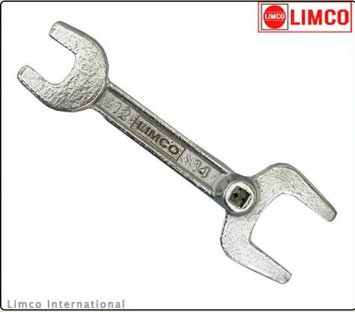
SPM-143 SPANNER MEDICAL GAS SPANNER MEDICAL GAS (CHROME PLATED)