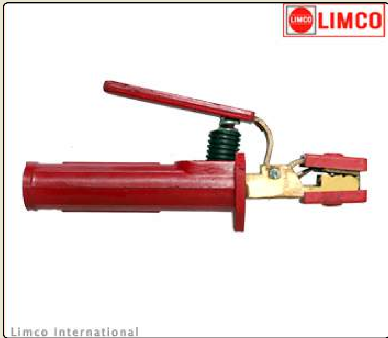
EH-03 ELECTRODE HOLDER 1000 AMP COPPER