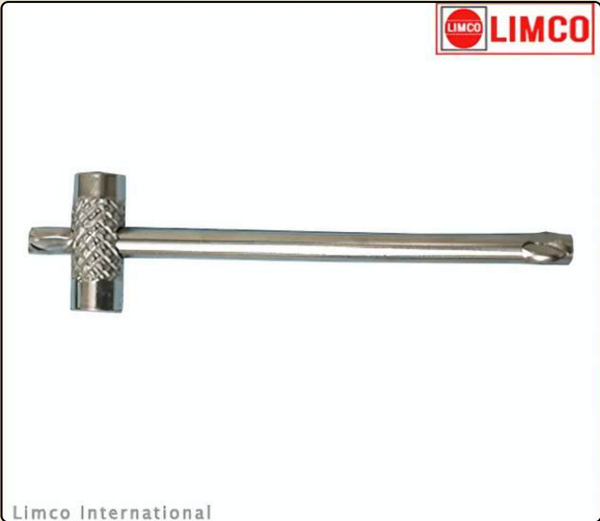
SPK-02 SLIDING SPINDLE KEY O2