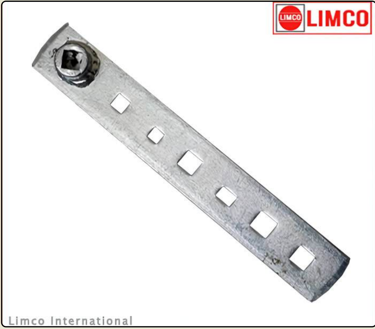
SPK-MP MULTI PURPOSE SPANNER