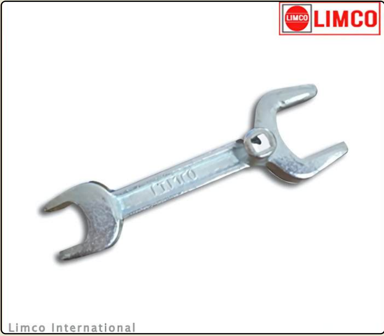
SPI-141 SPANNER INDUSTRIAL GAS SPANNER INDUSTRIAL GAS (ZINC FORGED)