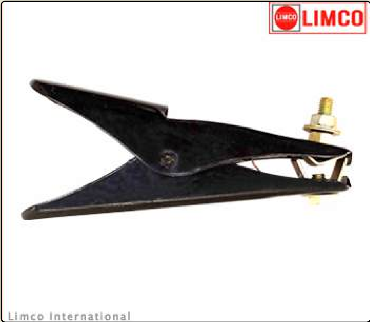
LLEC-08 EARTH CLAMP 600 AMP BLACK