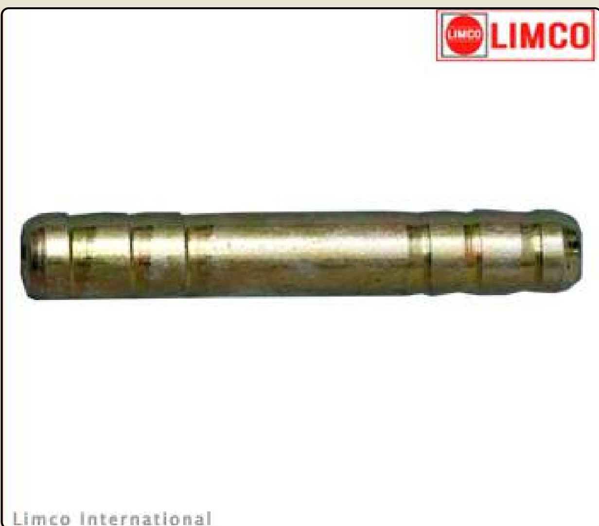
PCR-01 PIPE CONNECTOR