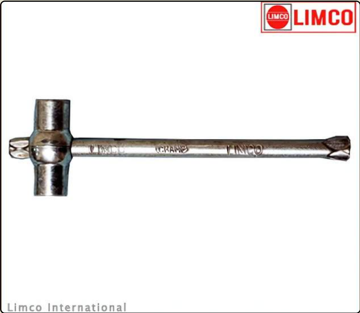
SPK-VX1 CHAMP KEY (HERO TYPE)