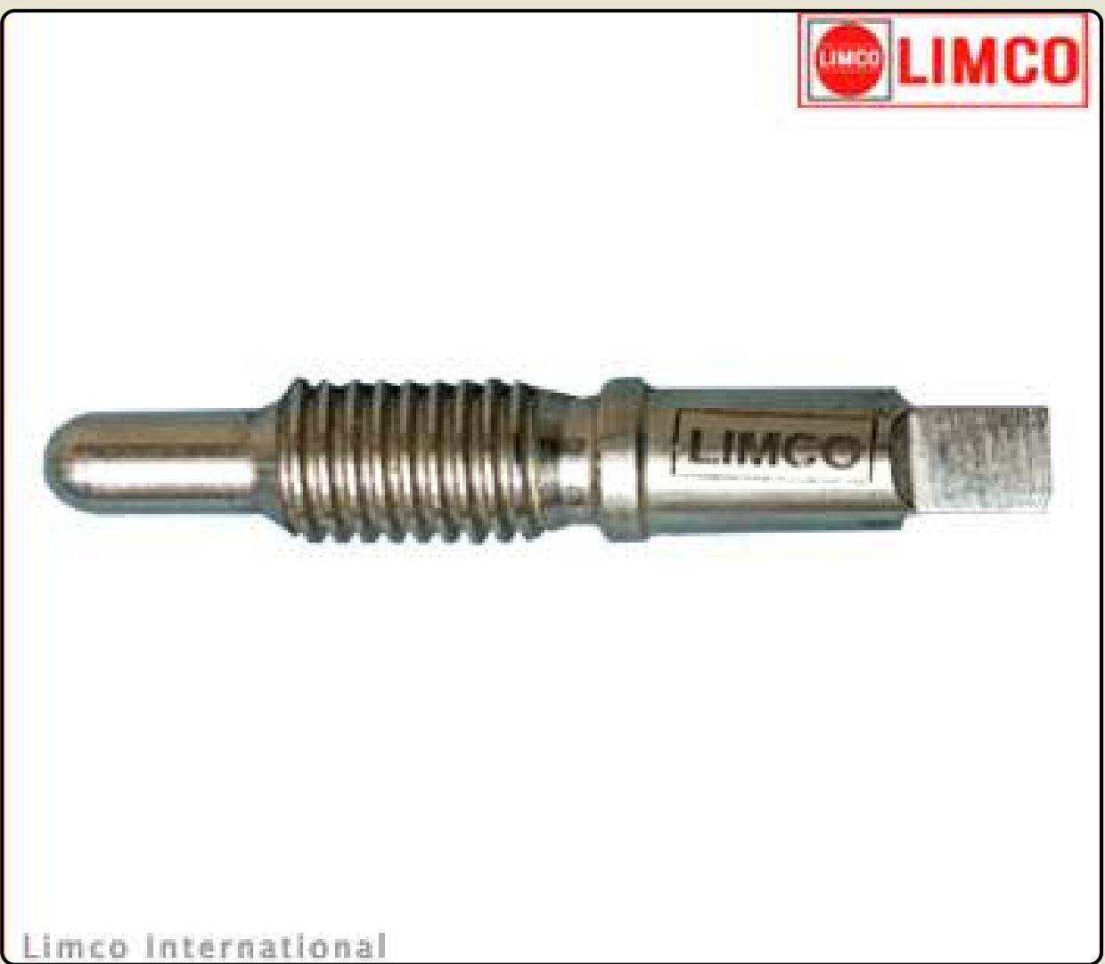
SPP-02 SPINDLE OVERSIZE