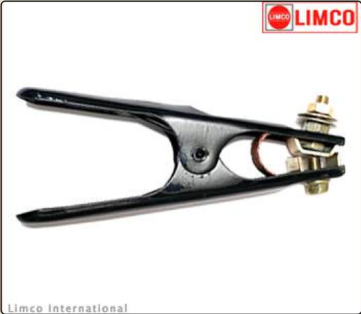
LEC-03 EARTH CLAMP 400 AMP BLACK