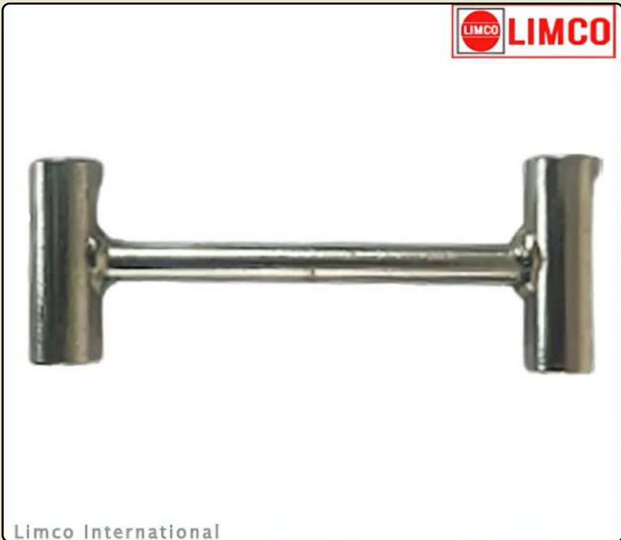
DOUBLE KEY CYLINDER