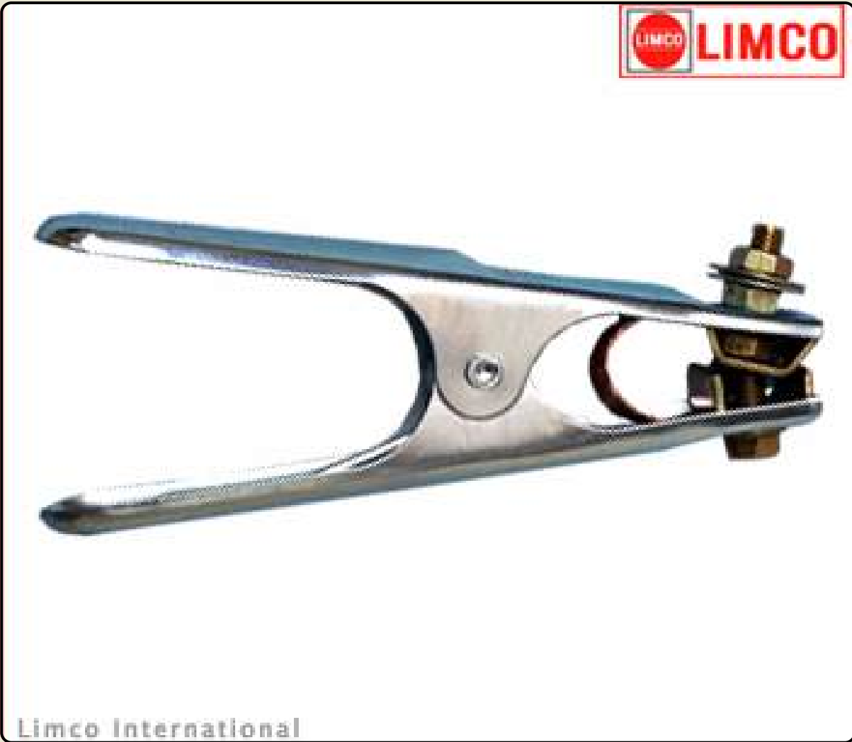
LEC-01 EARTH CLAMP 400 AMP