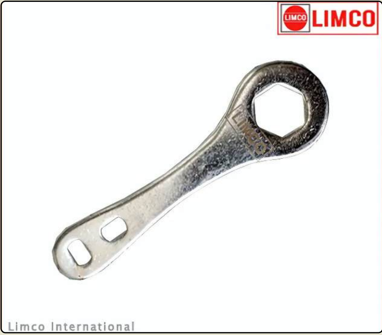
SPK-20 SPINDLE KEY NITROUS OXIDE SPINDLE KEY NITROUS OXIDE (CHROME PLATED)