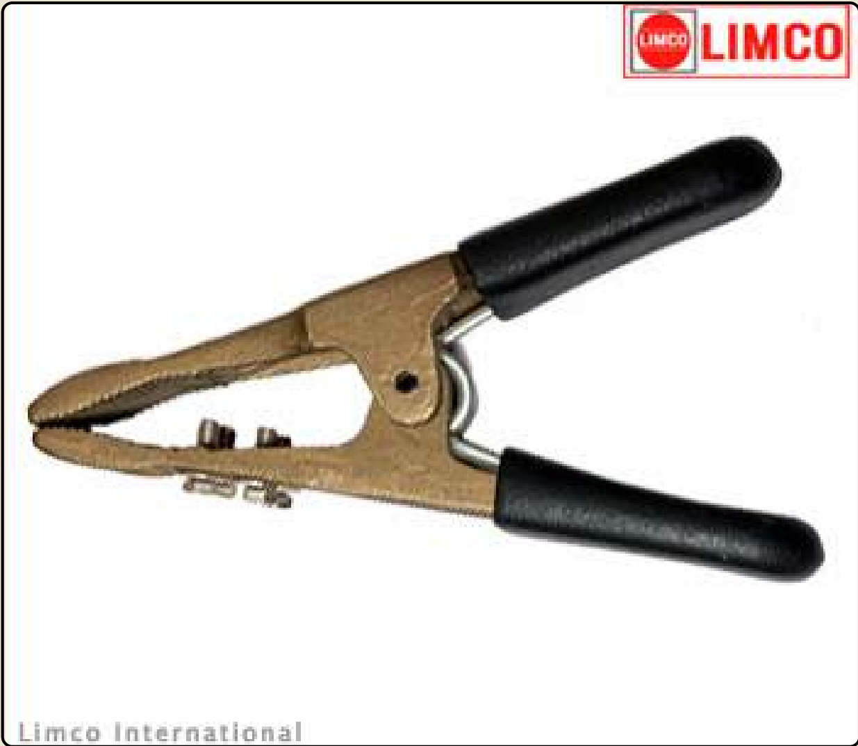
BRASS EARTH CLAMP 600 AMP