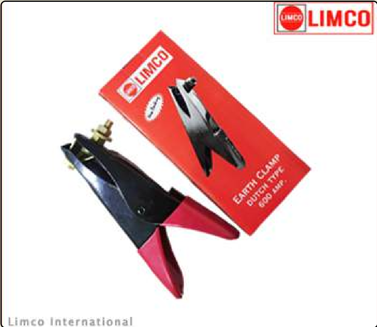
LEC-09 EARTHING CLAMP 600 AMP INSULATION