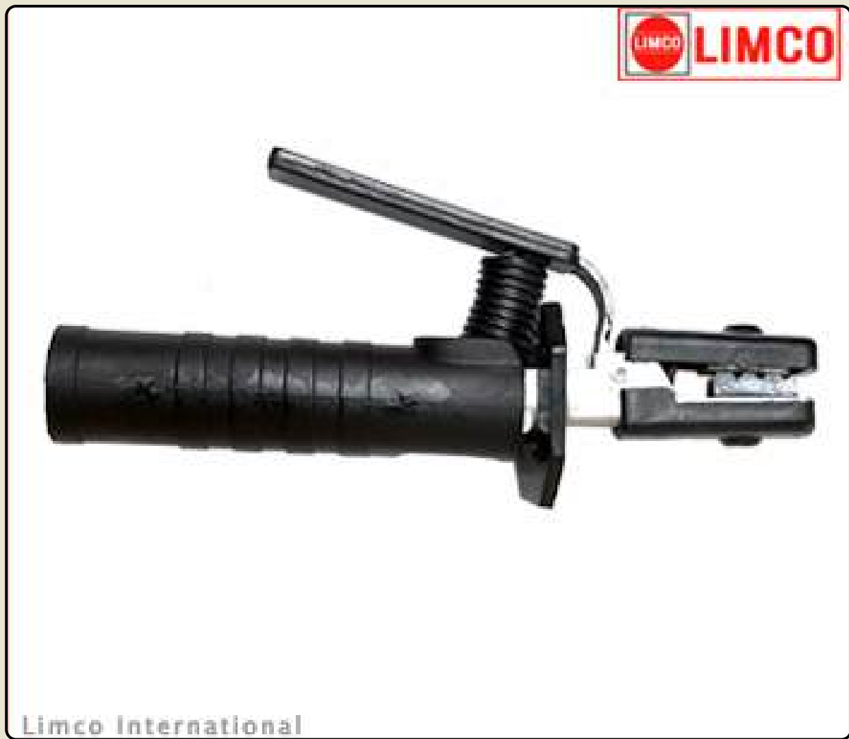
EH-01 ELECTRODE HOLDER 1000 AMP BLACK