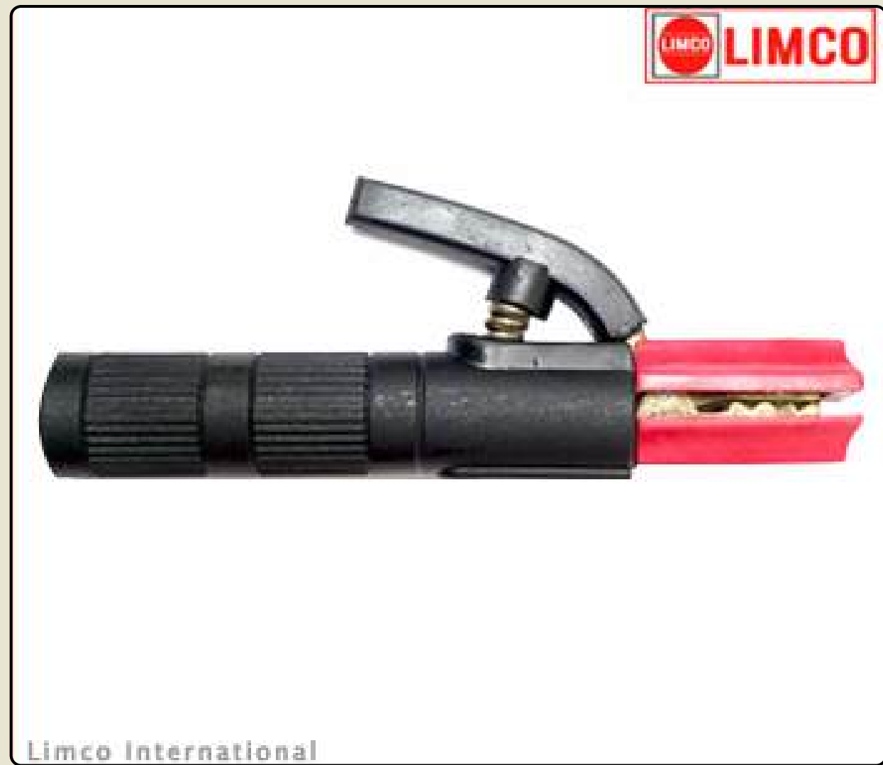
EH-02 ELECTRODE HOLDER 600 AMP BRASS