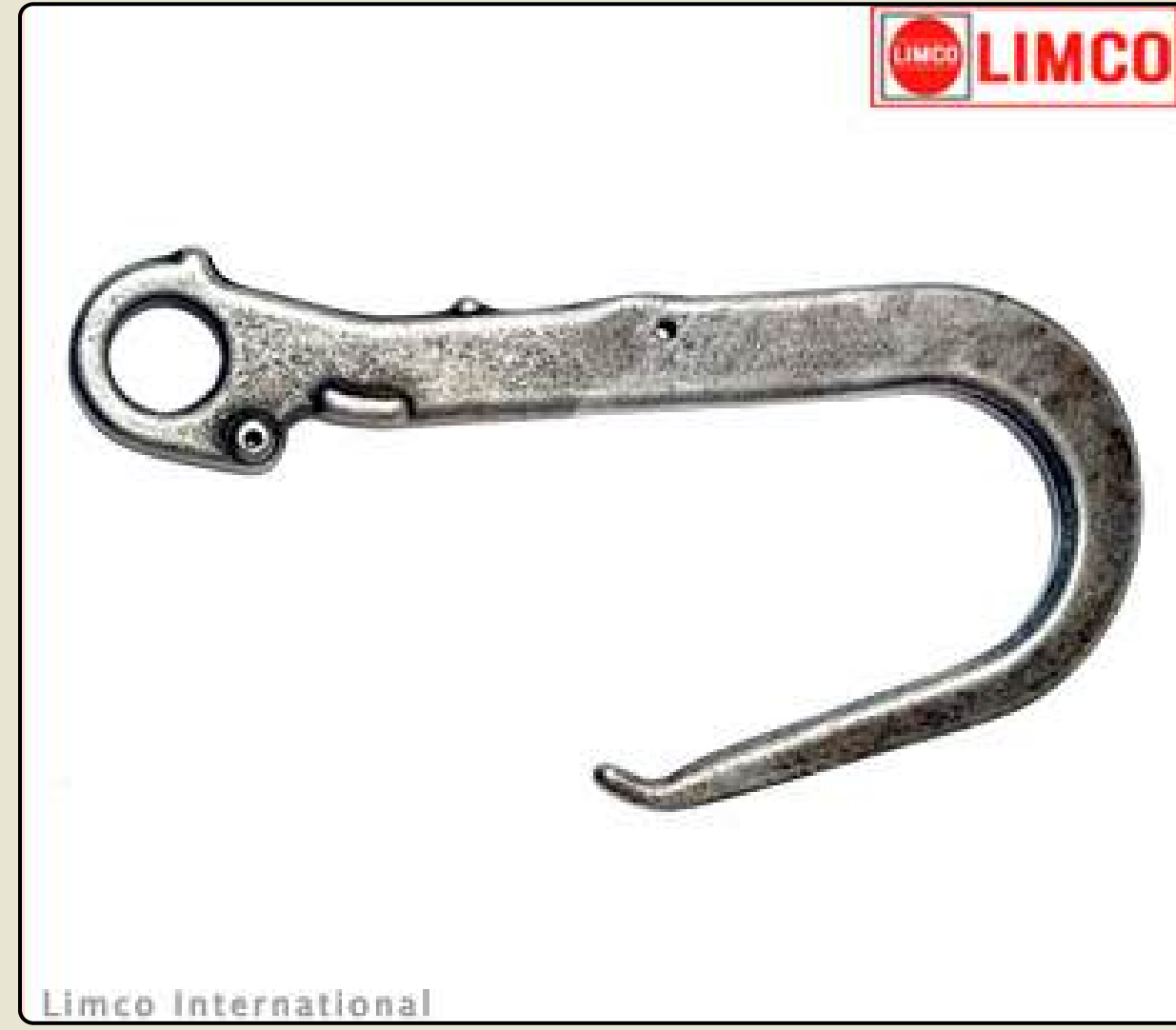
SCAFFOLDING HOOK FORGED