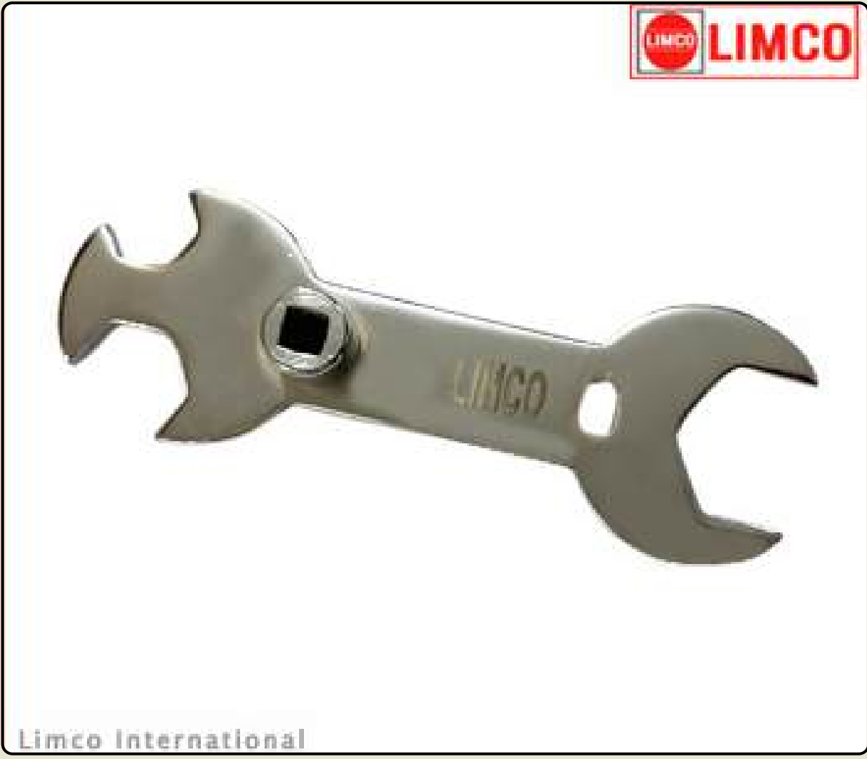
SPN-5W 5 WAY SPANNER FOR MEDICAL GASES(CHROME PLATED)