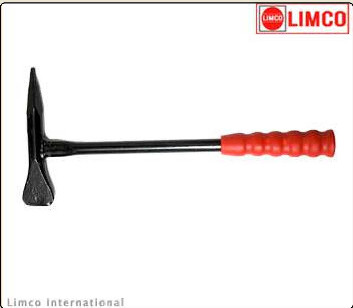
LCH-02 CHIPPING HAMMER RED