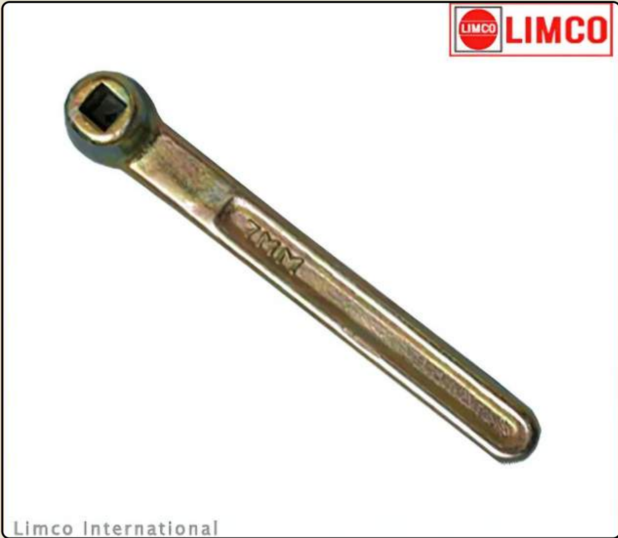
LIMCO FORGING KEY SPK-DF SPINDLE KEY OXYGEN(DROP FORGED) BLACK/GOLDEN/CHROME