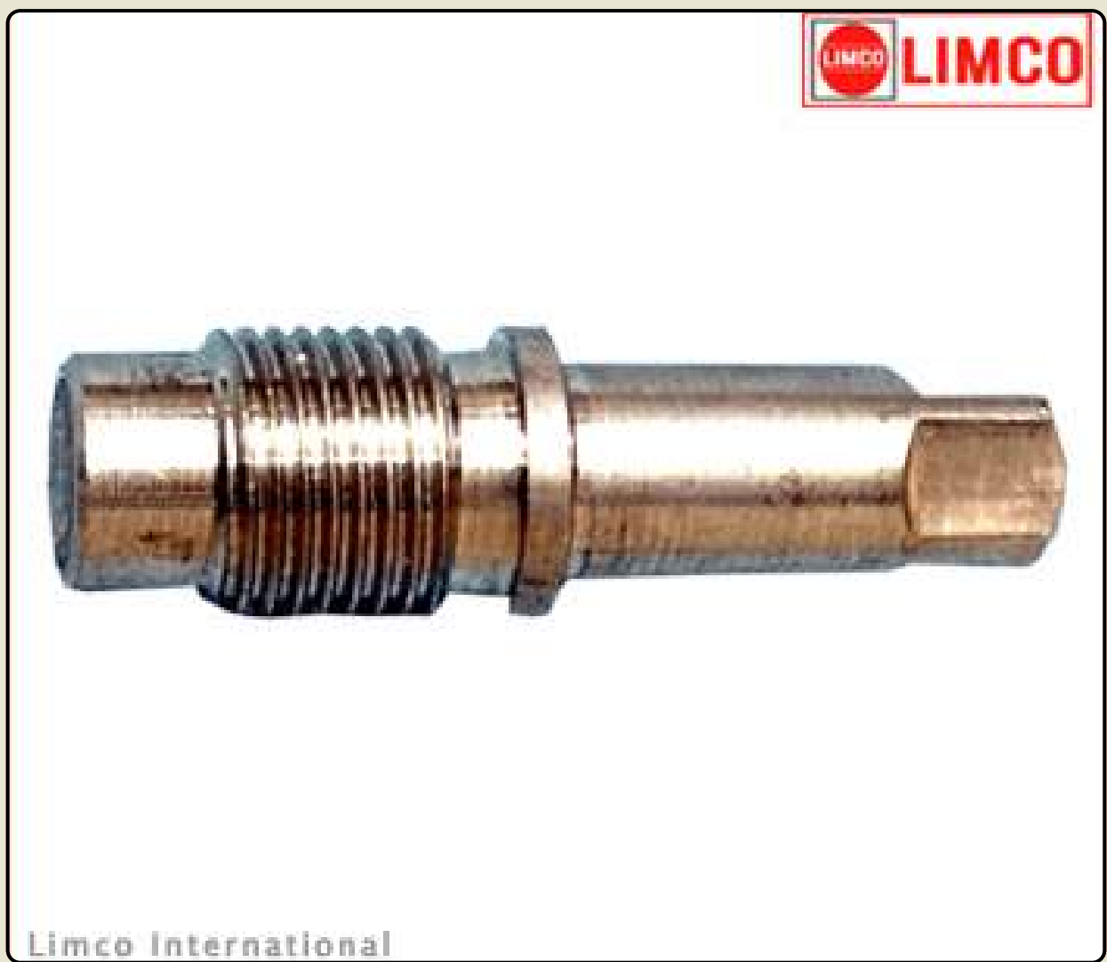
SSP-C02 SPINDLE CO2 VALVE