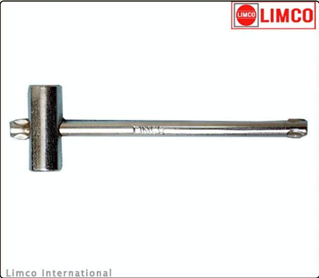
SPK-LCO2 SLIDING SPINDLE KEY CARBONDIOXIDE (HARDENED & TEMPERED)