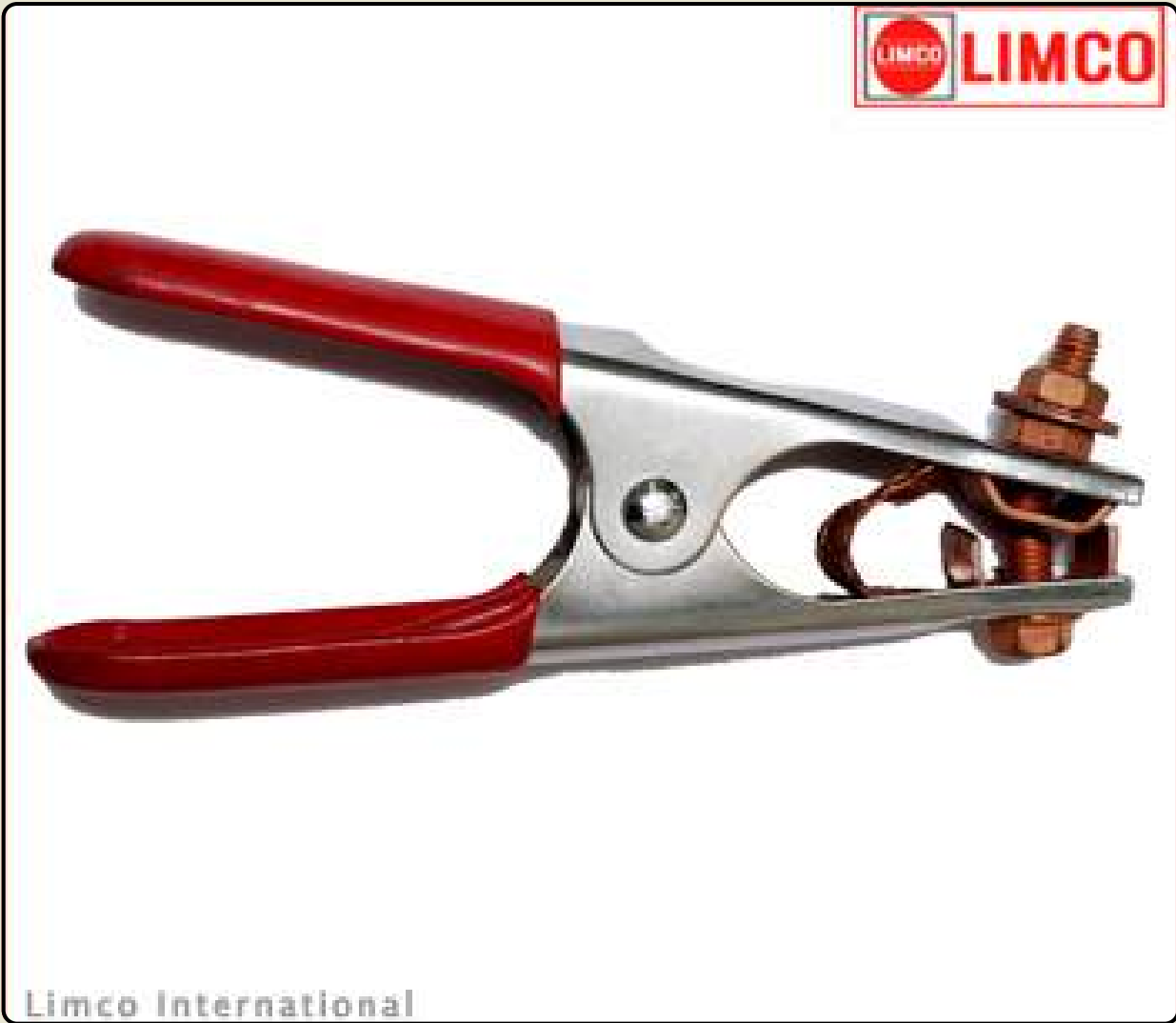
LEC-04 EARTH CLAMP 400 AMP PVC