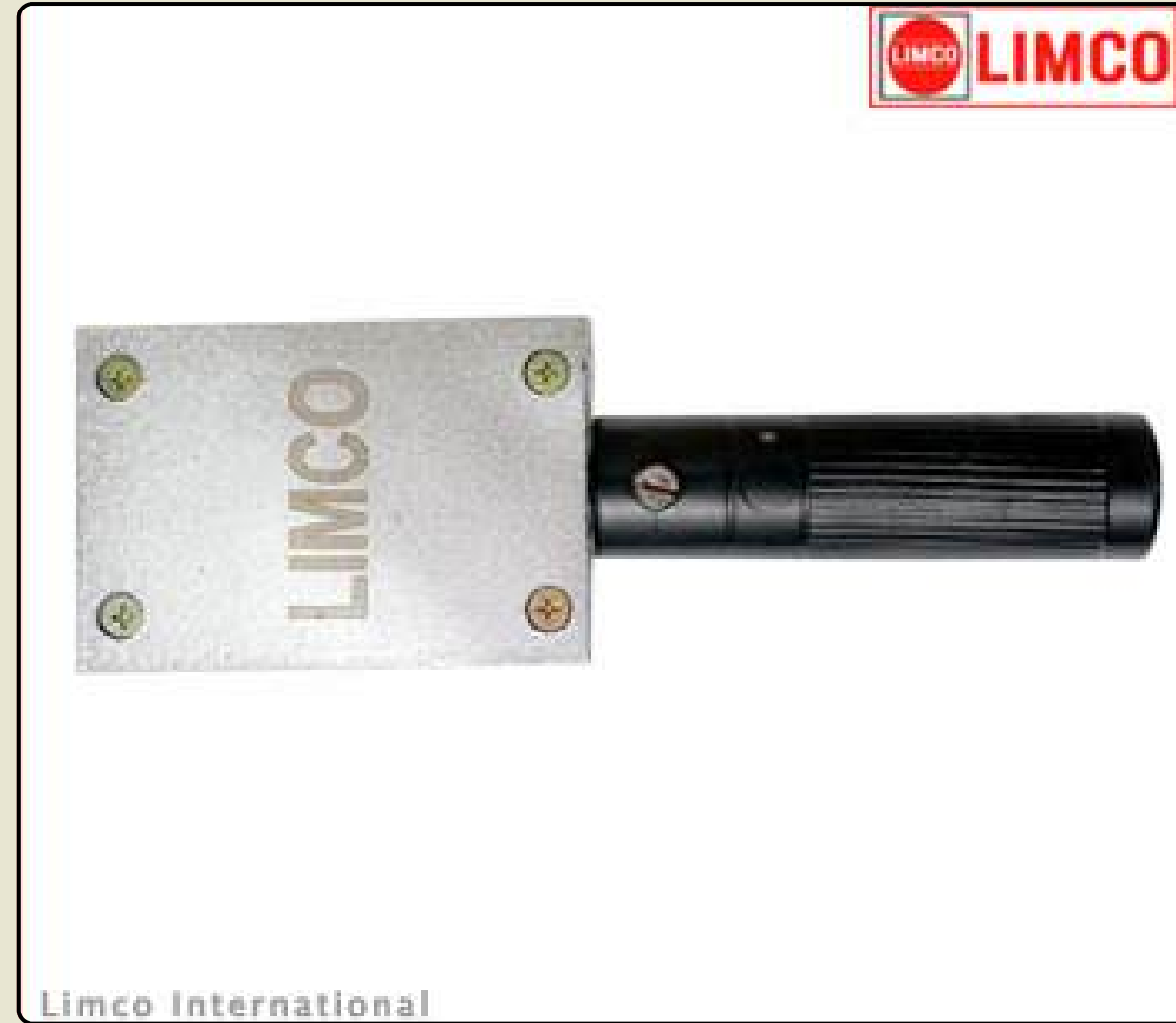
MAGNETIC EARTH CLAMP