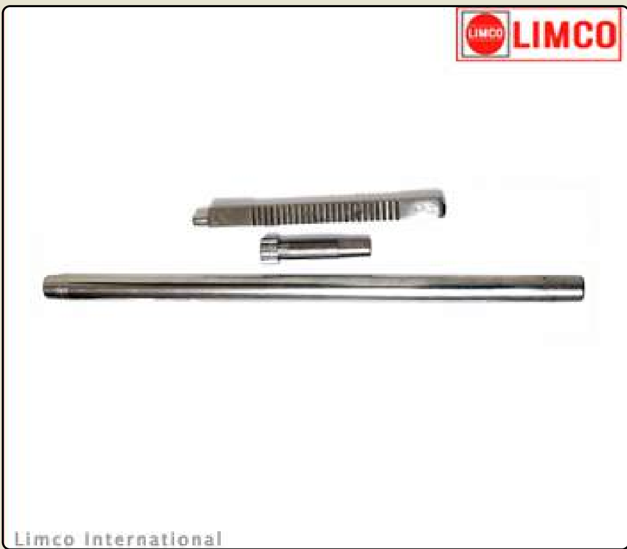
SET 23 MM