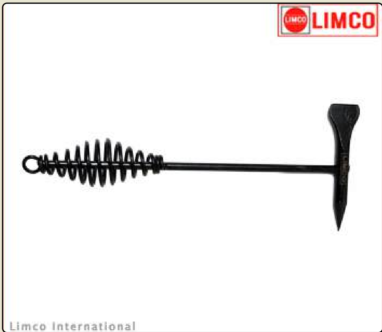
LCH-01 CHIPPING HAMMER LIGHT