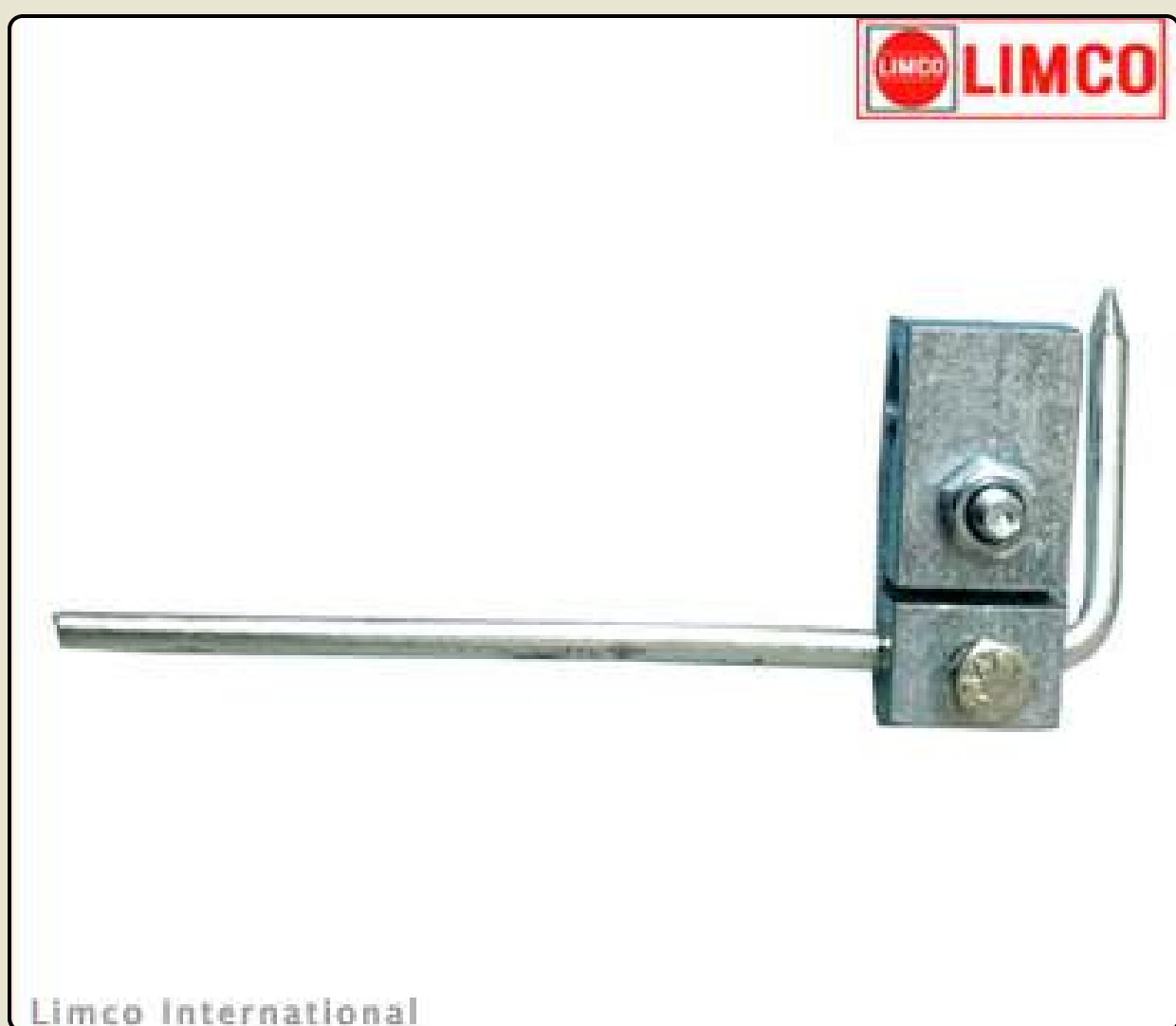
CAH-01 CIRCULAR ATTACHMENT FOR GAS CUTTER