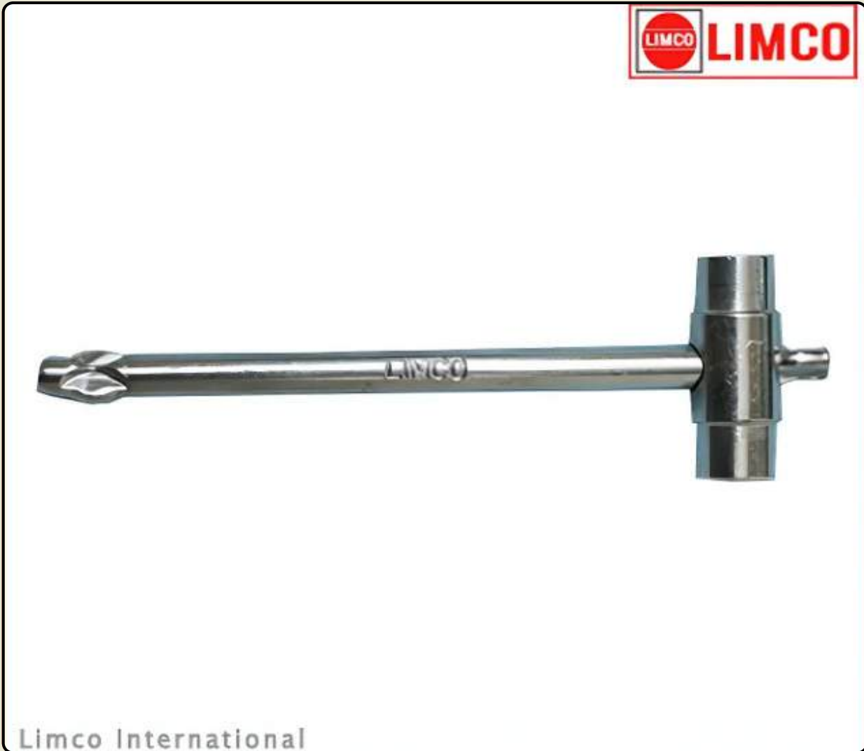
SPK-L02 SLIDING SPINDLE KEY OXYGEN (HARDENED & TEMPERED)