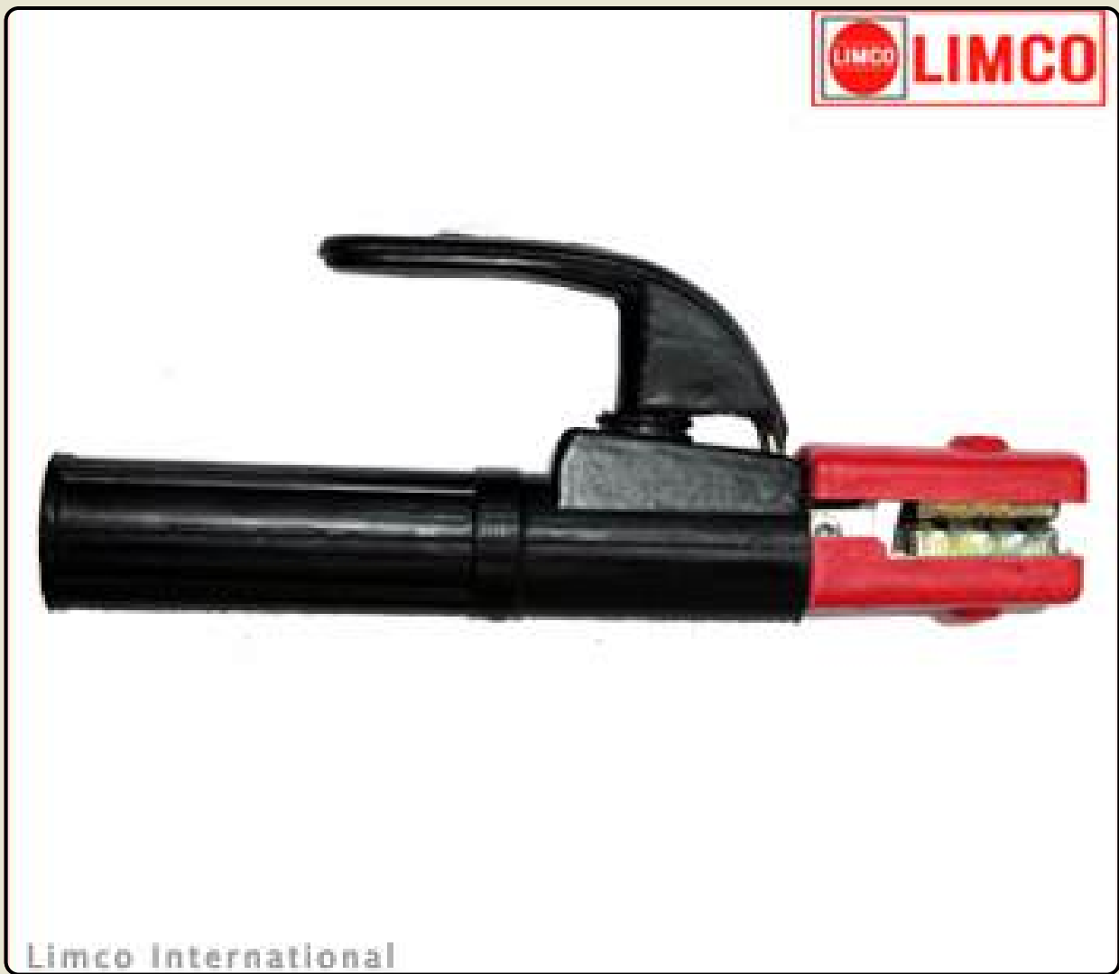
EH-04 ELECTRODE HOLDER 100AMP FULLY INSULATED